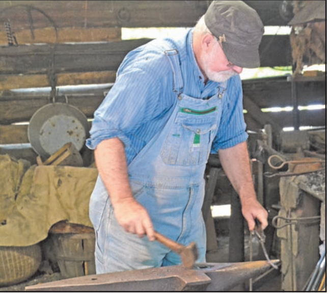
Blacksmithin' is one of the many live demonstrations of pioneer crafts available at the annual Fall Festival.

"Then we also have the helicopter rides on the weekends. We've had that before," she said. "Then we have some new arts and crafts.