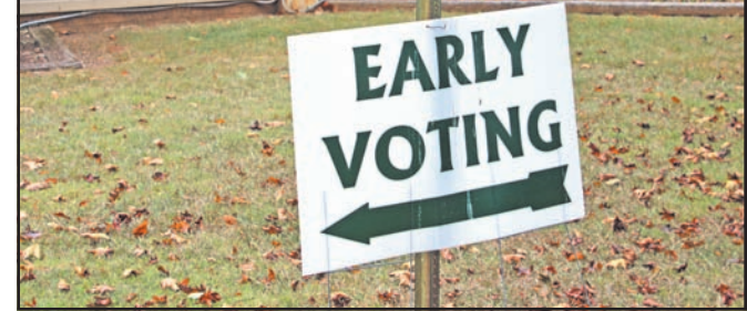
An early voting sign outside the Towns County Courthouse during last year's election cycle.